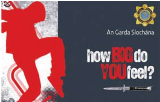
The How Big Do You Feel? campaign reached more than 10,000 young people, online and offline, in 2009 and the key messages of the campaign will be delivered for many years to come.

The campaign adopted a low-key and community-based approach to the issue of knife crime, using the expertise of An Garda Síochána’s community Gardaí. The campaign provided community Gardaí with a toolkit to enhance their existing community and schools visits programme. This toolkit was developed in consultation with community Gardaí.