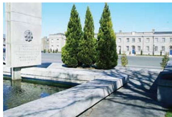
The housing section manages the repair and maintenance of the Garda estate, which includes major complexes such as Garda Headquarters (pictured).