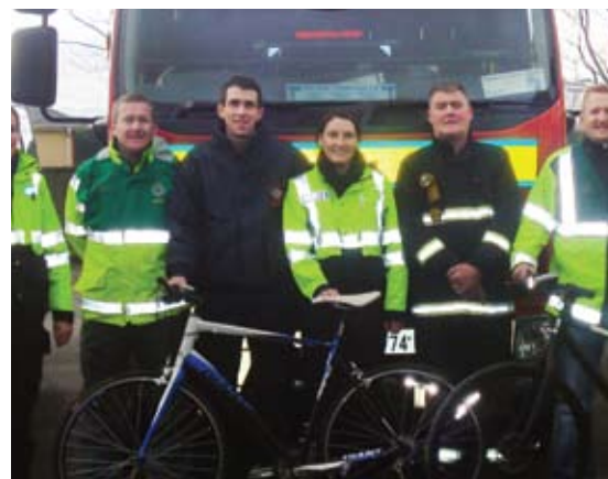
The inaugural Emergency Services cycle was organised by community Gardaí, raising €14,000 for charity. The cycle covered a course of 64 miles from Tralee to Killarney and back via Castleisland.