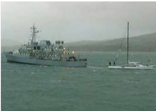
An Garda Síochána's involvement at MAOC(N) in Lisbon has yielded operational and intelligence results for Ireland and our European partners in combating the trans-Atlantic maritime trafficking of cocaine.

An Garda Síochána's first year of involvement at the Maritime Analysis Operations Centre – Narcotics MAOC(N) in Lisbon concluded in autumn 2009, yielding operational and intelligence results for Ireland and our European partners in combating the trans-Atlantic maritime trafficking of cocaine.