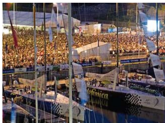
Over the course of two weeks, 650,000 people visited Galway and Salthill for the Volvo Ocean Race, breaking all attendance records of any stopover destination in the history of the race.

The policing of this event reflected very positively on the public image of An Garda Síochána. The "Lets do it Galway" committee's Global Economic Impact & Media Report commented that: "The success of the Galway Volvo Ocean Race Festival would not have been possible without the support of ... An Garda Síochána who ensured the safety & security of the event. They truly won the respect of all 650,000 people who attended.