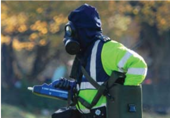
CBRN training has been consolidated in all Garda regions, with 170 responders trained throughout the country and Inspectors appointed in each region.

Also in 2009, a two day Mass Fatality Training Conference was organised by the Office of Major Emergency Management for senior members of An Garda Síochána. A draft national Mass Fatality Plan has been developed as a result of the output of these sessions and work on its phased implementation is ongoing.