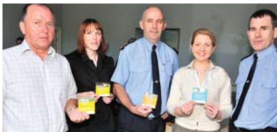
Training for off-licences took place in January, organised by Fermoy Gardaí in association with the Health Promotion Department of the HSE.

The Fermoy Says No to Drugs campaign was a partnership between the Fermoy Garda district, the HSE, community drugs workers and the local vintners and publicans. Over the course of the May Bank Holiday weekend, local licensed premises used beer mats which featured drug and alcohol related advice. Security staff also wore similar high visibility clothing. Ten per cent of the beer mats were printed in Polish. The initiative was launched through a high profile media campaign.