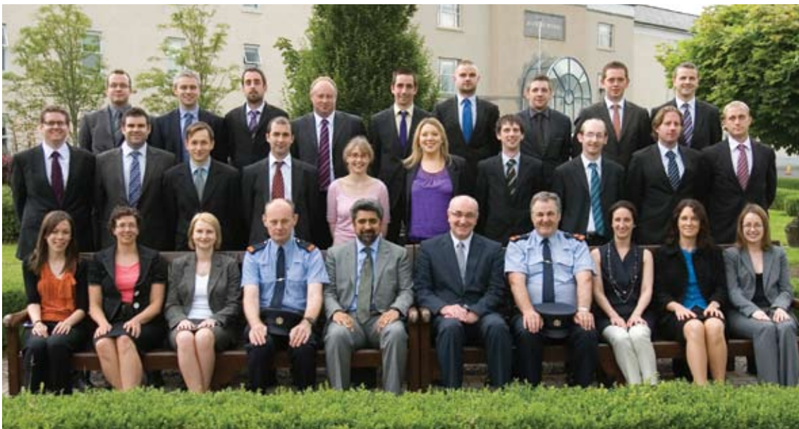
Members of the team attending the GSAS conference, which took place in July 2009.

Inspectors have been appointed in each region to supervise training and call out of responders. A CBRN Commanders course was developed in Belgium in conjunction with the Department of Defence for two Garda members on a 'Train the Trainer' basis. Skills learned will be disseminated throughout the organisation as a result.