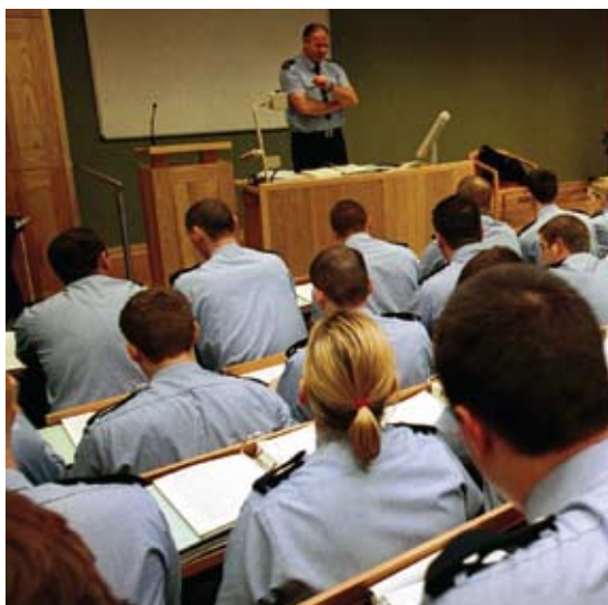
Training is developed and delivered during the year by the Strategic HR Unit.

Some 40 Gardaí received training in fraud investigations and first responders for IT crime, as part of a joint program between An Garda Síochána and the PSNI. The course has received accreditation from Limerick Institute of Technology, offering one third of the credit points for a Higher Certificate in IT Security and Investigative Techniques.