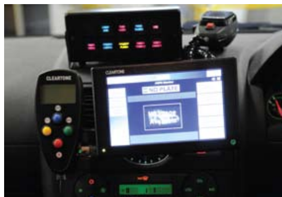
ANPR technology has been rolled out nationwide, with a total of 104 vehicles, mainly Traffic Corps vehicles, fitted with the technology. ANPR vehicles are now deployed in every Garda division in the country.

Automatic Number Plate Recognition (ANPR) uses optical character recognition technology to automatically read vehicle registration plates and represents a useful tool available to Gardaí in road traffic enforcement. ANPR has now been rolled out nationwide, with a total of 104 vehicles, mainly Traffic Corps vehicles, fitted with the technology.