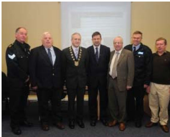
Éamon Ó Cúiv TD, Minister for Community, Rural and Gaeltacht Affairs (centre), launched the Cahircashelalert.com website, which includes information from 18 Community Alert schemes and 11 Neighbourhood Watch schemes.

The website also includes links to www.garda.ie and the Muintir Na Tíre website http://www.muintir.ie/welcome.htm