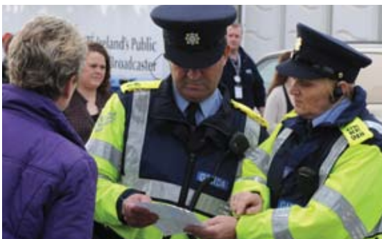
During the year, members of the Garda Reserve attended many large-scale events around the country including the National Ploughing Championships, which were held in Athy, Co. Kildare.

These events provided an excellent opportunity to raise awareness of An Garda Síochána's community policing approach and to learn about the concerns of the community in relation to a variety of issues. Members of the Garda Reserve, accompanied by full-time Garda members also participated in many local District initiatives and took part in Freshers' Weeks, Volunteering Fairs and Career Exhibitions in many third level universities and colleges around the country.