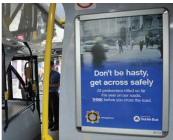
An Garda Síochána's poster campaign, "Don't be hasty, get across safely", which was run in conjunction with Dublin Bus, advised passengers to be vigilant for passing vehicles when alighting from the bus.

In 3 of the 5 years between 2004 and 2008, the number of pedestrian fatalities in Dublin equalled or exceeded the number of fatalities for both vehicle drivers and passengers combined. In 2009, a total of 40 pedestrians were killed on Irish roads, which equates to 16.6% of fatalities.