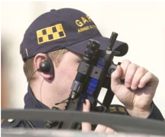
Garda Regional Support Units (RSU) provide effective support to frontline Gardaí in their response to critical incidents and serious crime.

RSU personnel are selected within their Garda regions on competency based criteria. Successful applicants must undergo 13 weeks intensive training in the Garda College. The training includes driving, firearms, tactics, first aid and critical incident management. During the tactical and critical incident segment of their training, RSU personnel receive guidance and training from the Emergency Response Unit (ERU).