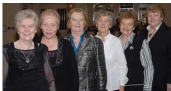
Gardaí in Cork held an event to mark the anniversary of 50 years of female members in An Garda Síochána in 2009, with the pioneering six women in attendance.

Gardaí in Gurrabraher introduced a pilot text service for the community, known as COMET , (Community Emergency Text). All subscribers complete and sign a form, in which they identify their age bracket and interest group. This enables Gardaí to target specific groups in the community with relevant messages. The initial release involves one way communications only but it is planned to develop COMET further to allow for two way messages including email, sms and mms messages. Messages can also be sent for and on behalf of partner agencies. The system was devised by An Garda Síochána and is being developed in conjunction with Eircom.