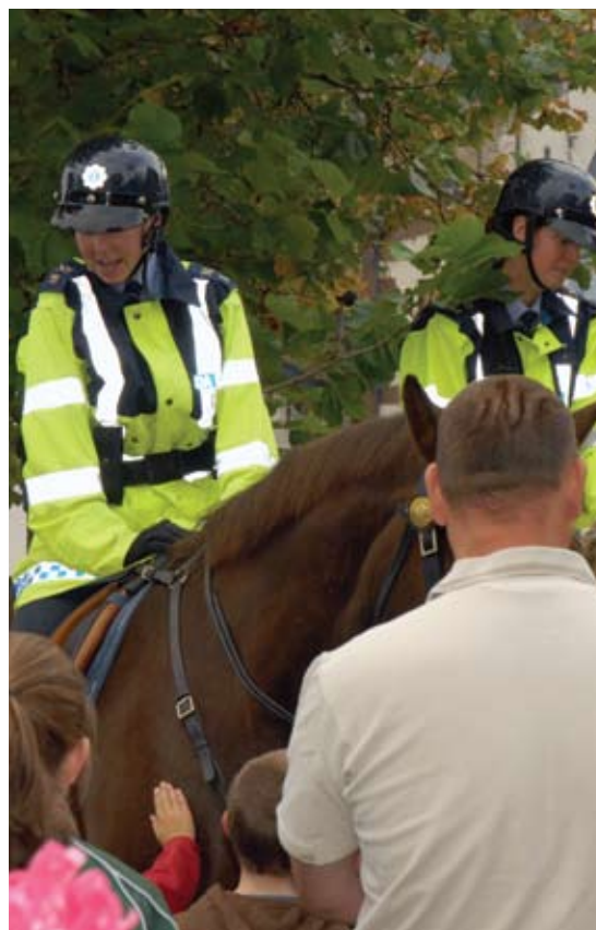
Members of the Garda Mounted Unit attended the Open Day at Wicklow Garda Station.

The units have been involved in several successful operations which resulted in arrests for robbery, burglary and theft. RSUs assist operational members in carrying out searches of dwellings, persons, and vehicles, in both armed and unarmed mode, depending on the circumstances. They have also been involved in several incidents where firearms have been used or threatened.