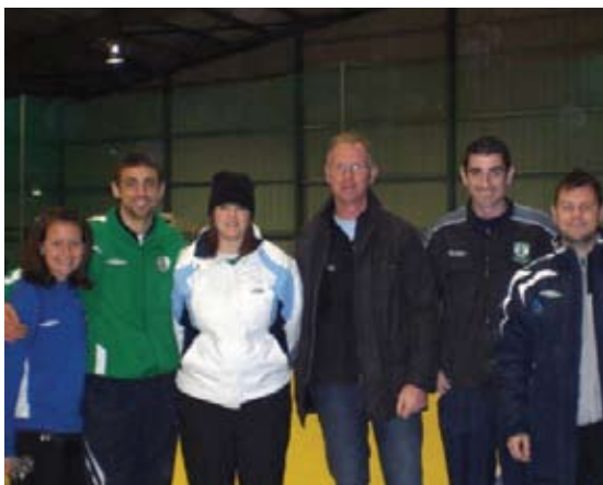
Gardaí from Ballymun, working with the FAI, established a 5 a side soccer league for young people in the area. The coordinating team are pictured above.

Twomey. Gardaí were selected and trained to develop and present an interactive knife awareness programme for all secondary schools in the division. The initiative was later extended to include youth clubs in the area, as well as third level colleges and universities.